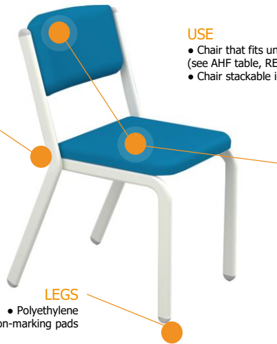
MOMENTA Design 4 legs