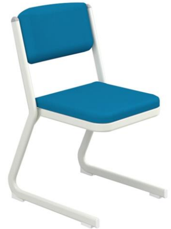
MOMENTA+ Design Cantilever