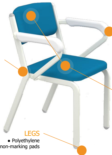
MOMENTA Design 4 legs