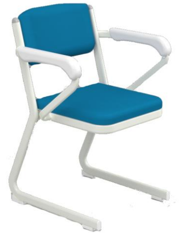
MOMENTA+ Design Cantilever